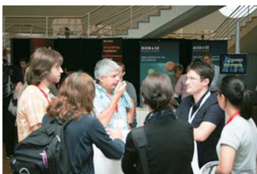
Posters, exhibition area and catering facilities are mixed to ensure efficient communication throughout the meeting

Delegates will have many opportunities to exchange experiences and ideas through discussions, workshops, poster sessions and software demonstrations. Workshops and tutorials on specialised topics and training in cutting edge research technologies will be held in small groups to promote interactive participation.