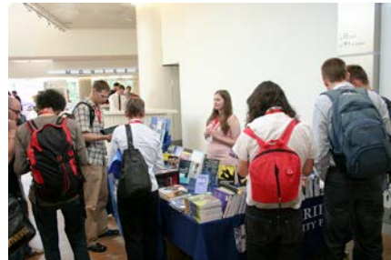
Students and PostDocs studying the latest book publications on display.

[BC] 2 attracts motivated and skilled students from Europe and all over the world. Around 500 participants are expected, which is a great opportunity for finding the best talents in this highly competitive area. This year the PhD students from the SIB Swiss Institute of Bioinformatics will organize a session with invited speakers about innovation management and start-up support to showcase successful entrepreneurship stories.