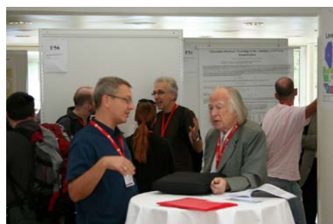
Scientific discussions at the poster sessions (Prof. Denis Noble, Oxford)

Prime exhibition space will be available in the centre of poster sessions, coffee-break areas and in front of the main auditorium. This central location will ensure frequent interactions between exhibitors and participants.